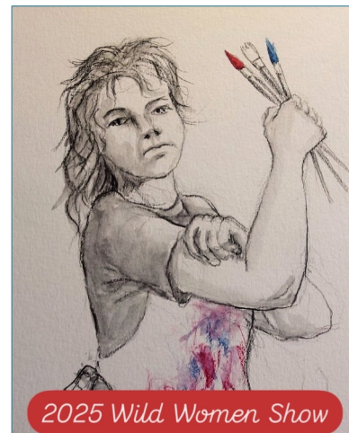
Exhibit at Lincoln City Cultural Center

Watch for more information on our website at https://www.rivergalleryart.com , and on our Facebook and Instagram pages.