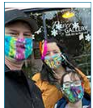
Partners (and family) having fun with their masks!!