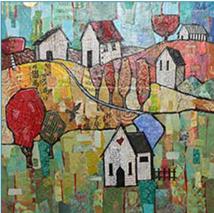
We are all in this together — Deanna White